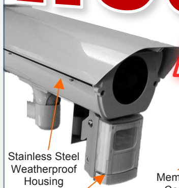
Stainless Steel Weatherproof Housing Optional Integrated LED Spotlight